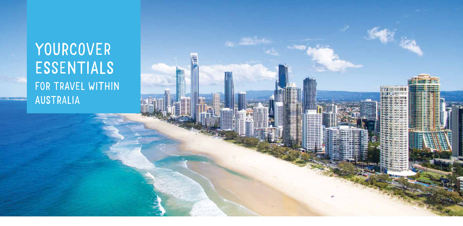
Below is a summary of the benefits provided. Please read this PDS carefully to understand what this policy covers.