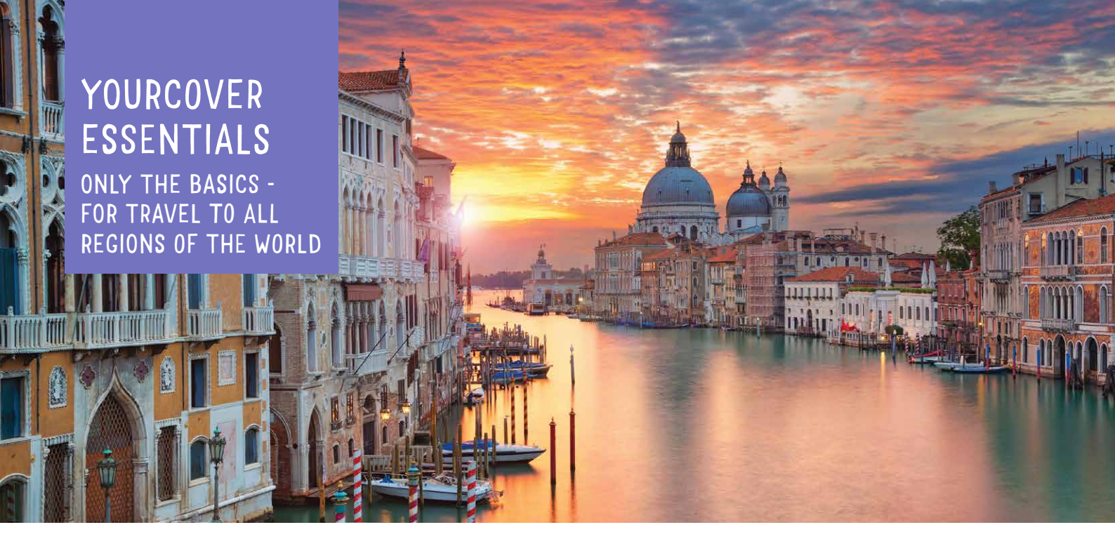
Below is a summary of the benefits provided. Please read this PDS carefully to understand what this policy covers.